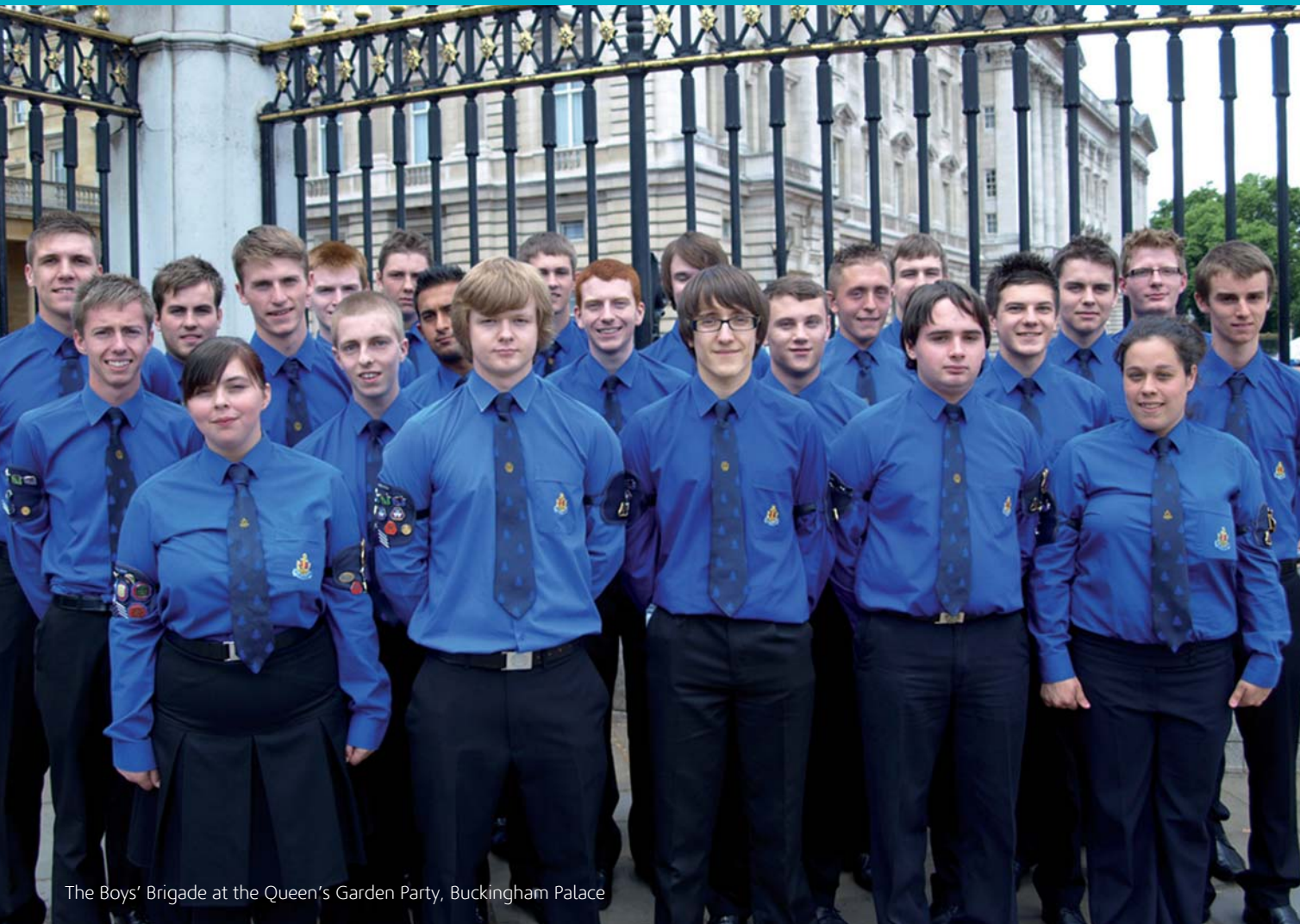
The Boys' Brigade at the Queen's Garden Party, Buckingham Palace

The Boys' Brigade continues to play a significant role in the mission and outreach of 1500 churches throughout the British Isles. Each week dedicated adult volunteers work with over 50,000 children and young people building positive relationships seeking to share the Gospel in a relevant and meaningful way.