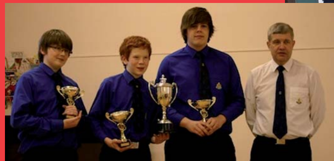
Table Tennis Final Winners 44th Glasgow