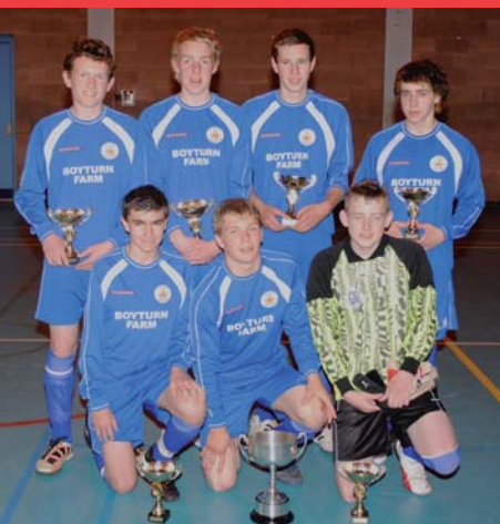
Junior 5-A-Side Winners - 1st Ardstraw