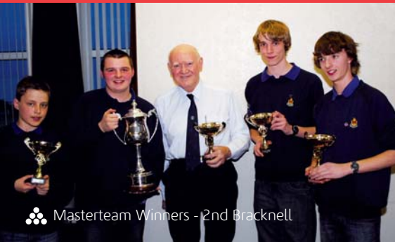
Masterteam Winners - 2nd Bracknell

National competitions are held each session to add to Company programmes and give members a picture of the wider Brigade.