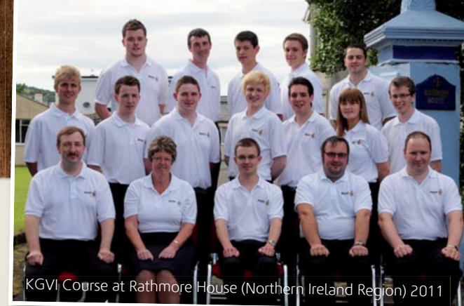
KGVI Course at Rathmore House (Northern Ireland Region) 2011

I joined BB at the age of four. At the time I really didn't know what was going on, I'd just begun Primary School and this was yet another new thing that terrified me. I vaguely remember my first night, but one thing that still sticks with