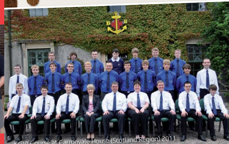
KGVI Course at Carronvale House (Scotland Region) 2011

This is where the KGVI Course came in and, having recently completed the two weeks I can say that the two weeks spent were the most enjoyable I have ever had. The people